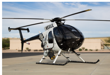
Las Vegas (NV) Police Department