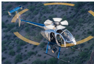
Mesa (AZ) Police Department