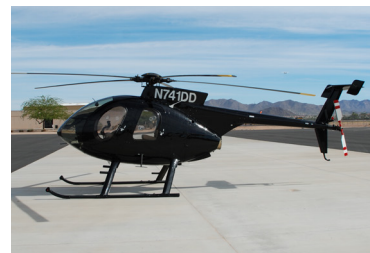
Verde Canyon Railroad, LLC