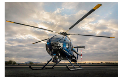
Virginia Beach Police Department