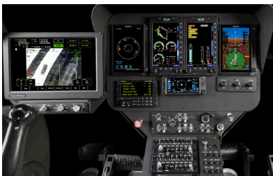
Glass Cockpit with Howell Instruments Engine Instruments Display & Garmin G500TXi MFD/PFD