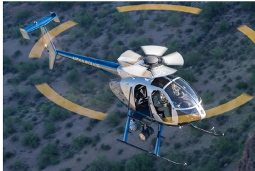
Mesa (AZ) Police Department