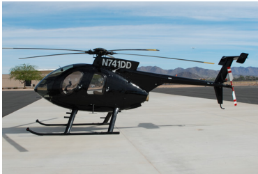
Verde Canyon Railroad, LLC