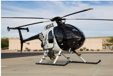
Las Vegas (NV) Police Department