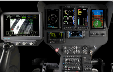
Glass Cockpit with Howell Instruments Engine Instruments Display & Garmin G500TXi MFD/PFD