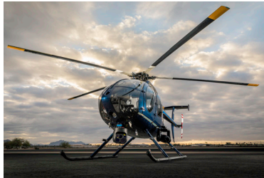
Virginia Beach Police Department